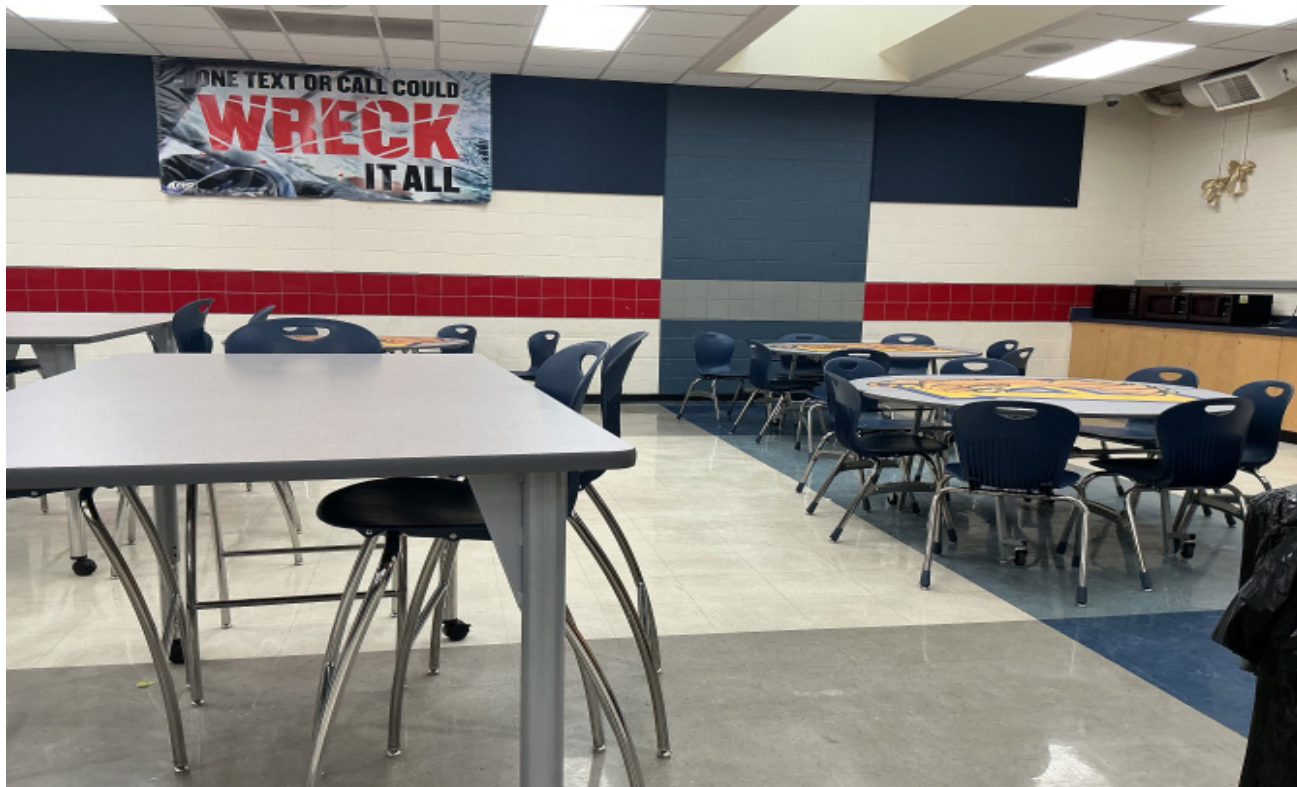
The new lunch tables as well with the new chairs. This new seating came to the AHS cafeteria in November.

The cafeteria recently got an upgrade with new tables and chairs due to Chartwells Food Company donating the furniture. I believe this is a great addition to the school. The new tables are a change from the old, and overall a welcome change. The old seats were falling apart and the tables were gross on the bottom. It gives the school a new look, even a somewhat professional look.