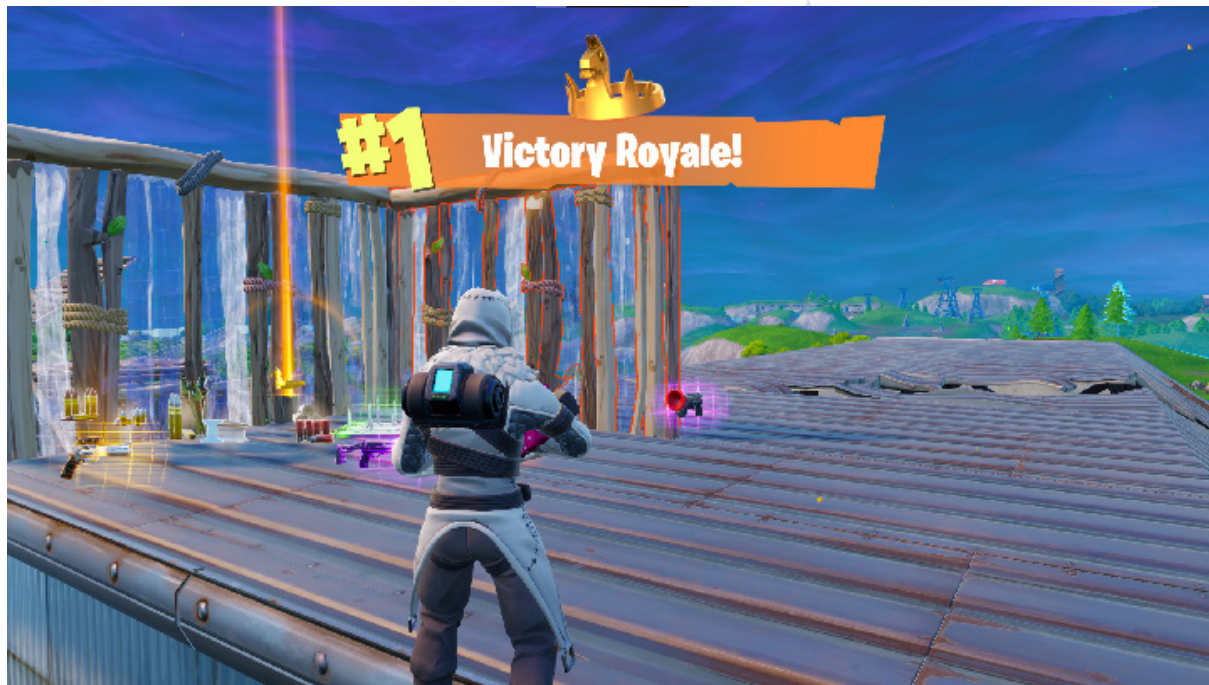
Player gets a victory royale in the new season seven throwback battle royale, titled "Fortnite OG."

Fortnite was released in 2017, and even now they still have frequent updates and an ever-growing fanbase. In almost any school that you walk into, at least one kid will be talking about Fortnite or referencing the game itself, despite being around eight years since the official release of the game. Fortnite not only gives kids something to do in their free time, but it also gives them a way to make new friends and build their existing relationships.