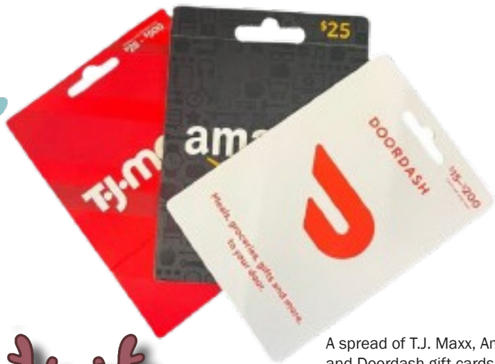
A spread of T.J. Maxx, Amazon, and Doordash gift cards.