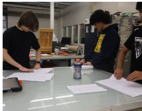
Students in Graphic Communcations folding books.

This CTE class not only provides students with the skillset to print, design and create, but is also a functional class, serving multiple specific purposes and it is used to bridge the gap between an idea and the viewer’s mind. This class allows students to be more hands on and turn their visions into reality.