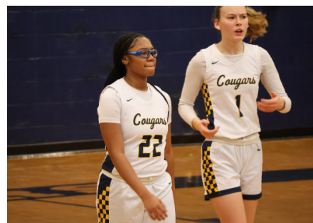
Varsity Cougars take the court.