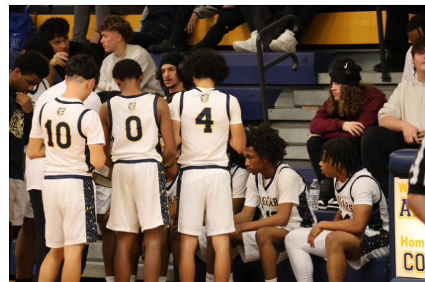
Cougars huddle during a timeout in the third quarter.

Although Roeper High School caught up with the Cougar's 20 point lead in the third quarter, our team was able to come out on top and secure the close win. This will mark a 3-1 record for the Cougars, a positive start to the week.