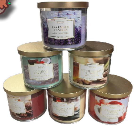
A stack of fresh scented candles.

Blankets are an enjoyable gift for everyone. They keep you warm in the winter, they are cozy, soft, and relaxing.