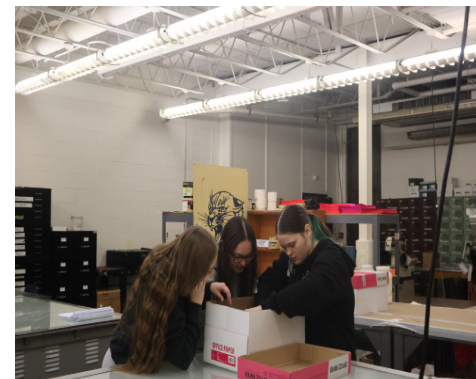
Students placing the books in the box for the elementary students.