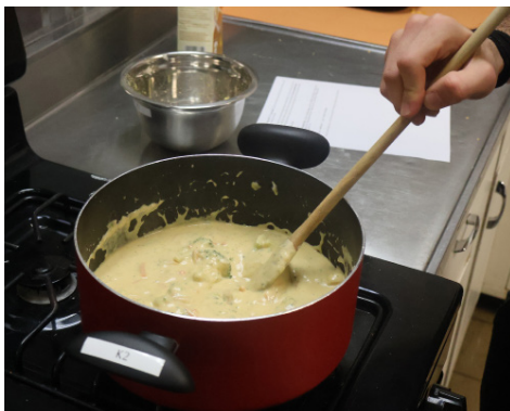
Culinary students mixing up the broccoli cheddar soup they made.