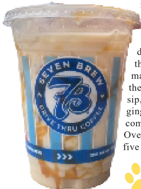
Iced chai with toasted marshmallow flavoring and caramel drizzle around the cup.

We ordered one of their classic drinks, an iced chai latte enhanced with toasted marshmallow flavoring and caramel drizzle around the cup for the price of $4.65. When we received the drink, it had a tan color with caramel drizzle around the cup. As we took the first sip, we could taste the toasted marshmallow syrup overpowering the chai flavor, but as we took another sip, the combination of flavors had a gingerbread-like flavor, which gave a comforting holiday feeling to the drink. Overall, we rate this drink a three out of five cougar paws.