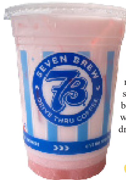
Fizz drink with strawberry, pineapple and cupcake flavoring with cream mixed in.

For the price of $3.35, we received a fizz beverage, which is sparkling water that can be infused with any flavor. We chose to add strawberry, pineapple, and cupcake flavoring with cream in the drink. When we received the drink, it had a pretty pink color with giving the impression that the strawberry and cupcake flavors were heightened rather than the other flavors. The first sip lacked explosive flavor and was a bit underwhelming, not tasting like what we expected. Overall, we would rate this drink a one out of five cougar paws.