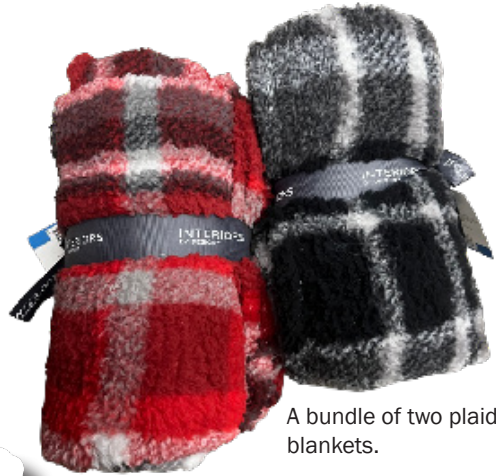
A bundle of two plaid sherpa blankets.

Gift cards are a great way to give a thoughtful gift while still giving the person receiving it the freedom to purchase what they want from that specific store.