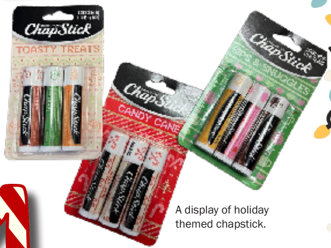
A display of holiday themed chapstick.

Candles are good gifts to give because keeping the living room, bedroom, or even kitchen smelling delicious is important.