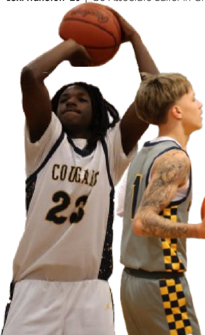
Varsity Cougars number 23 and number 1.