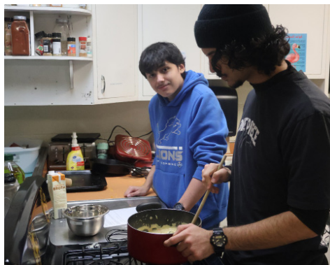
Culinary students making broccoli cheddar soup.

Culinary not only gives students a hands-on introduction to career skills but also provides them with practical kitchen skills and a better understanding of opportunities available to them in the culinary field.