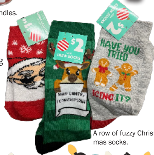
A row of fuzzy Christmas socks.

Chapstick is always a safe gift to give because naturally everyone's lips get chapped. Especially during the winter, chapstick is an essential that everyone should keep on them.