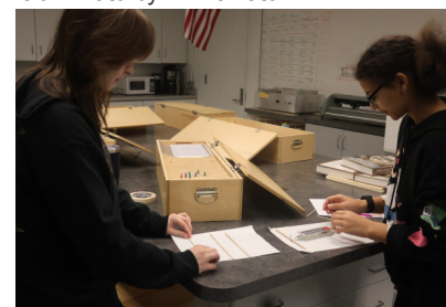
CAD students doing a lab on deflection.