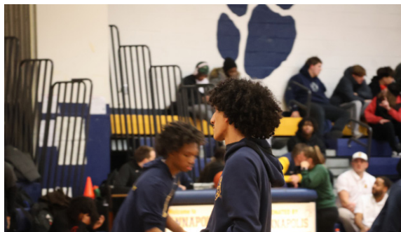
Varsity Cougars warm up to take the court.