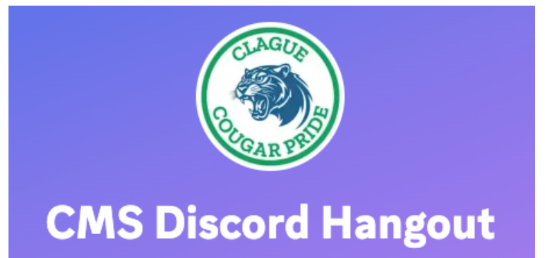
Image of Clague Middle School Discord Hangout Logo