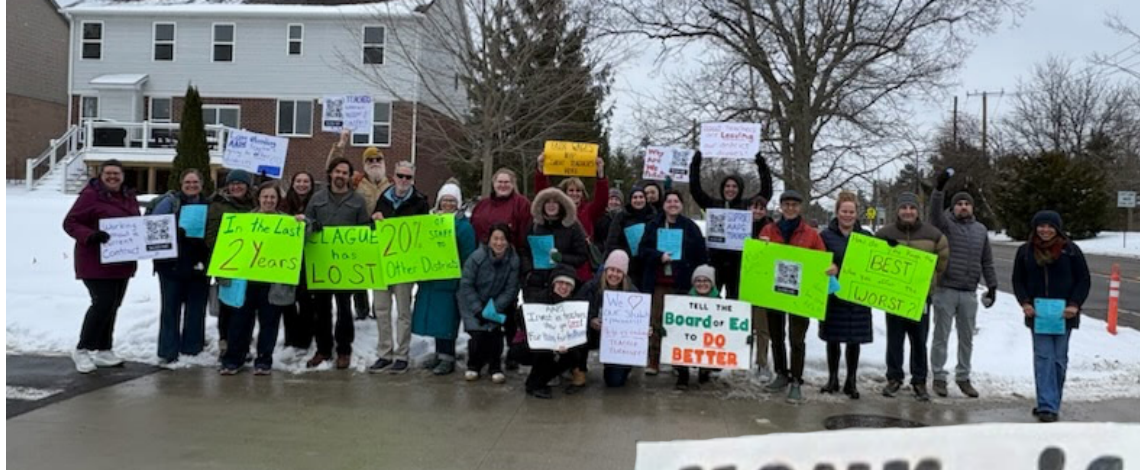
Educators and community members picketing outside of Clague on Feb. 3. The teachers have been working without a contract since the start of this school year.

At Clague, the most significant transitions are happening within the classrooms. A trend of large-scale staffing challenges has swept the nation in the past year, leaving long-term substitute teachers the only available option to teach a large percentage of core classes and