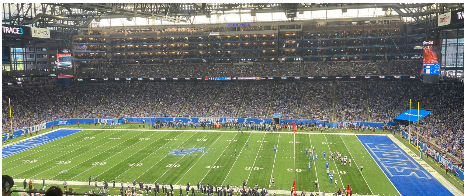
A picture of the Detroit Lions playing football

season and lost in the Division Series (second round) of the playoffs. They started off the season with two straight months of 19 wins each, at one point reaching a record of 54-39, which is 25 games over .500, becoming the first team to reach 50 wins this past season. The Tigers were on pace for an all-time year for the franchise, but a 7-17 month of September dropped them severely in the American League and to second in their division. In the first round of the playoffs, they defeated the Boston Red Sox two games to one in a best out of three series. In the Division Series, they played the Seattle Mariners in a best-of-five game series, losing three games to two, ending a roller coaster of a season and solidifying their spot as one of the worst falfoffs in MLB history. This past season was a disappointment to most Tigers fans, but only because of the amazing first half of the season.