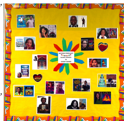
Poster of Black Voices Month books