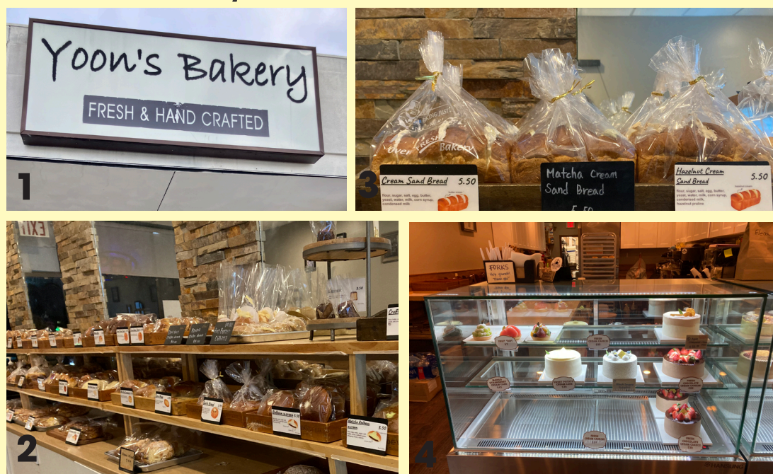
1. Yoon's Bakery is a Korean inspired pastry shop that serves a variety of sweet and savory foods.