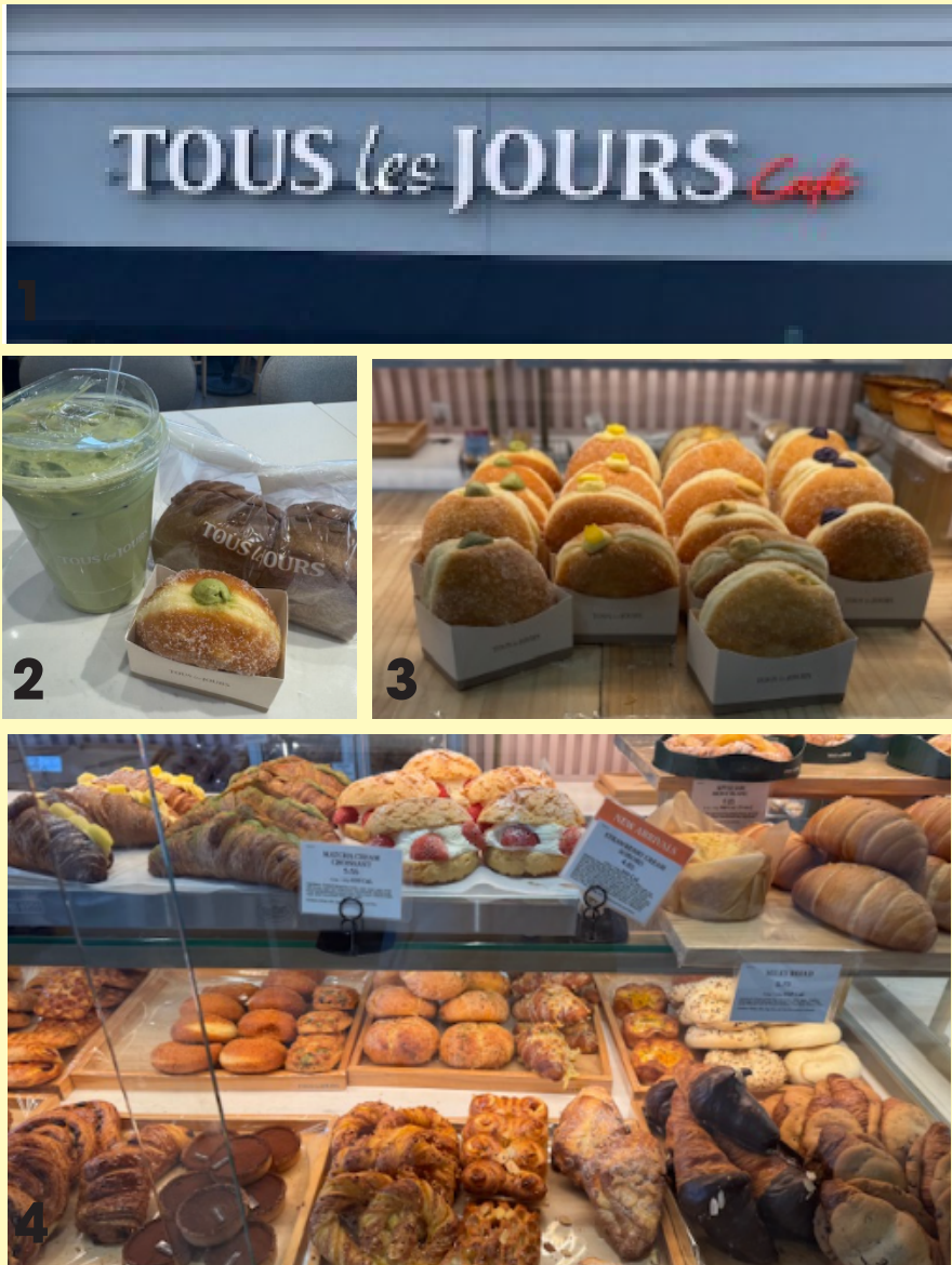
1. Tous Les Jours is a French influenced bakery with a wide variety of sweets.