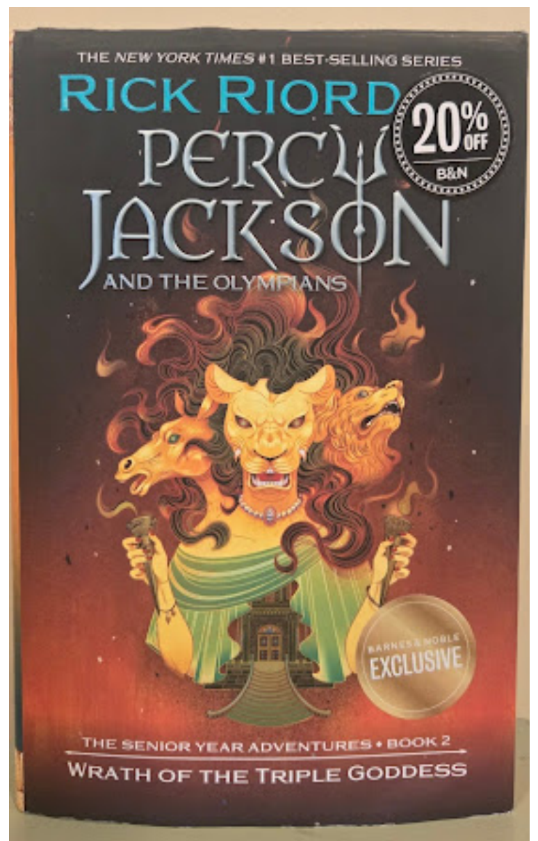
Percy Jackson is a book series along with a hit TV show. The five book series was written by Rick Riordan.

Overall, I would give the Percy Jackson series a 9 out of 10. I think Percy Jackson and the Olympians is an incredible fantasy series. The book is full of suspense and almost forces me to turn the page. The Disney+ show just completed its Season 2 in January 2026, and Season 3 is coming out later this year. I recommend this series and the show for readers who enjoy humor, action, and mythology.