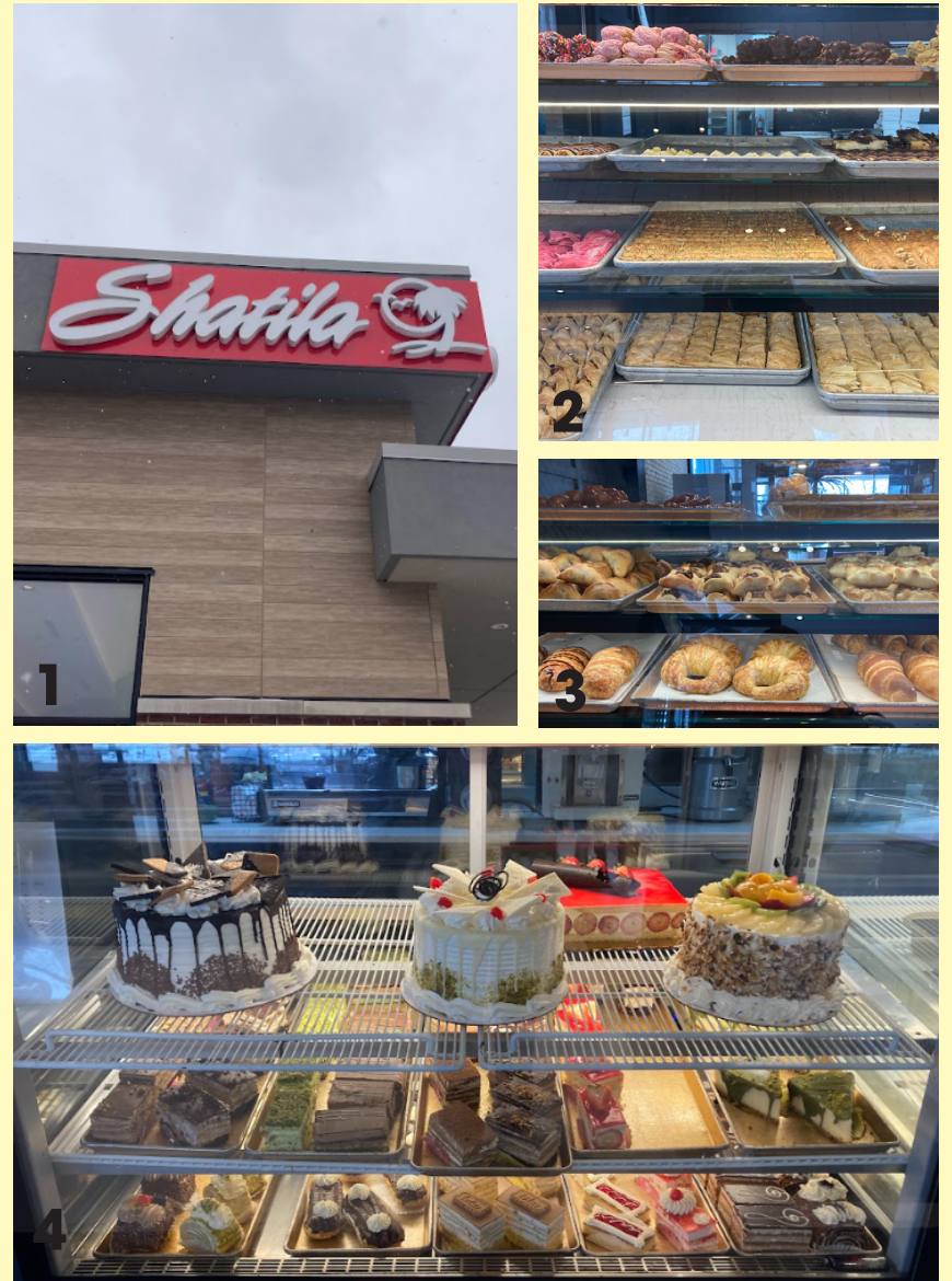
1. Shatila Bakery bring the classic flavors of the Middle East while adding a modern French twist.